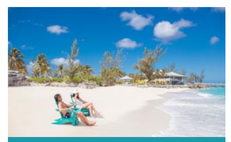
RELAX ON PARADISE-LIKE SANDY BEACHES AT THE EDGE OF THE WORLD