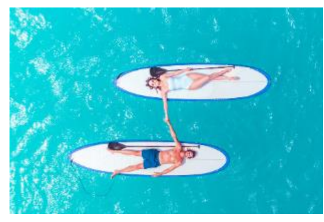
Scuba and water sports lovers